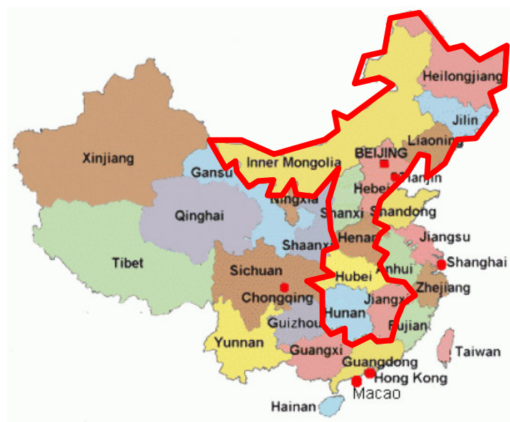
Figure 2: Coverage of Panel Data Sample

The panel data used covers 796 utility and non-utility coal-fired power plants distributed throughout 12 provinces in the mainland of China, including Henan, Hubei, Hunan, Jiangxi, Heilongjiang, Jilin, Liaoning, Inner Mongolia, Beijing, Tianjin, Hebei and Shanxi, and encompassing the area circled by the thick line in Figure 2.