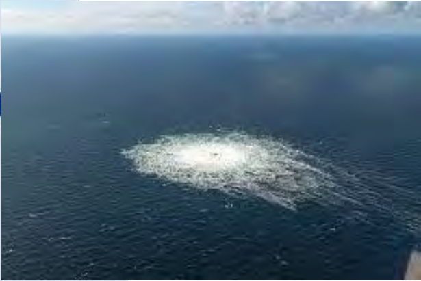
Nord Stream Pipeline 26 September 2022